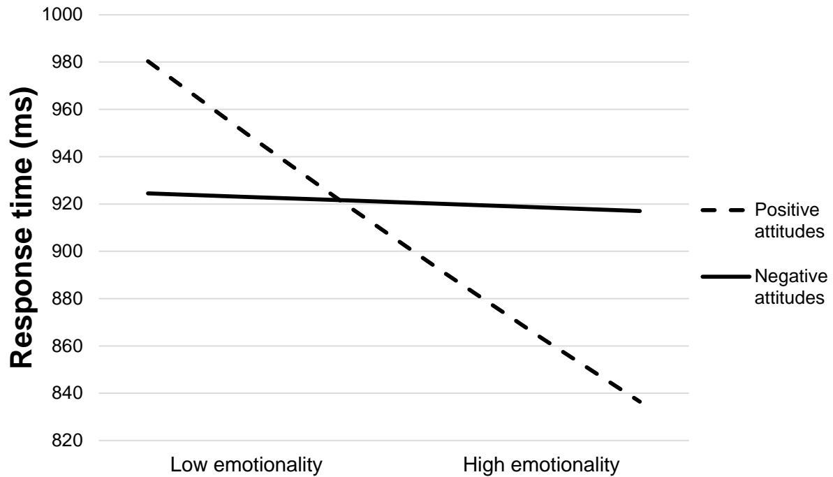
Figure 1 – Mixed model from Studies 1 – 3 relating the implied emotionality of the adjectives to response time (transformed from log milliseconds back to milliseconds) as a function of valence, controlling for extremity. Values on the x-axis represent the approximate range of possible values in the sample.