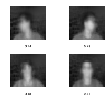
(b) The mean faces in the pose view.